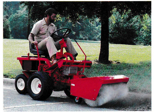
Optional Power Brush for cleanup and snow removal.