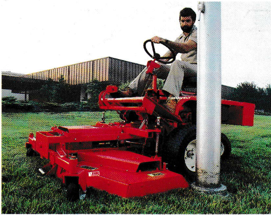
Pro Master demonstrates zero inside turning radius.