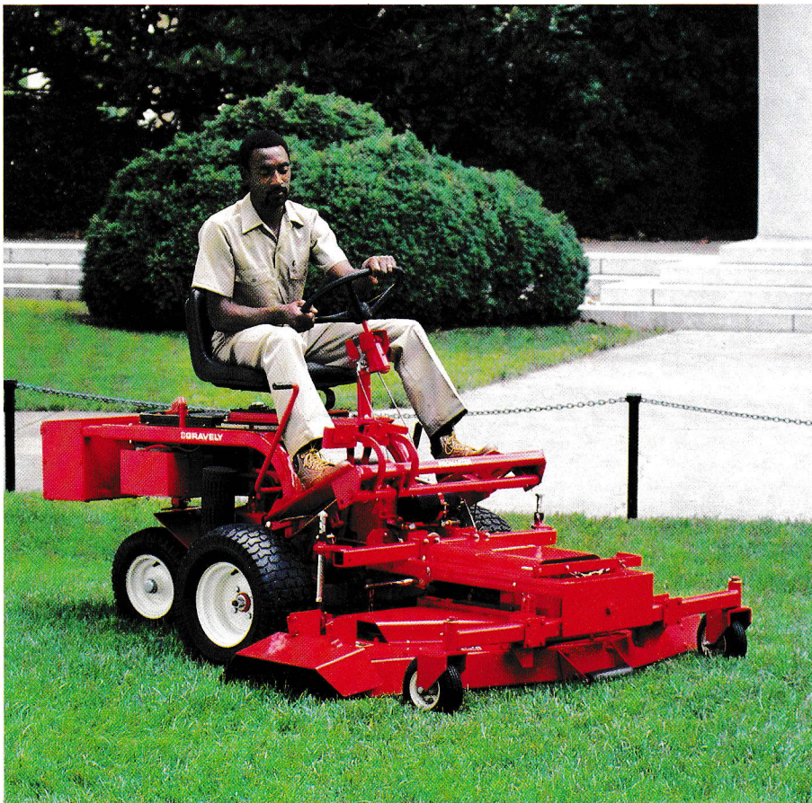
Pro Master with 60" (152 cm) Mower, 19 hp Kohler engine.