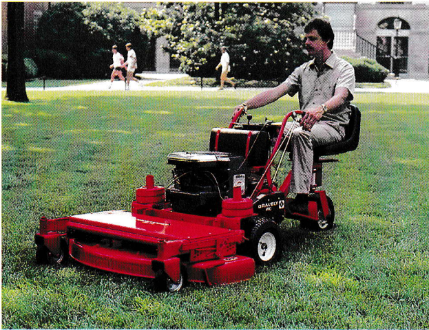
Pro with 60" (152 cm) Mower, 18 hp Briggs & Stratton engine, optional riding sulky.