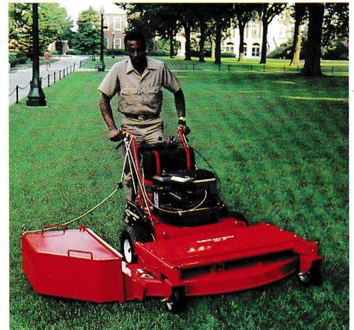
Pro with 50" (127 cm) Mower and optional metal, dump grass catcher.