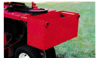
Loaded weight box increases stability and steering traction.