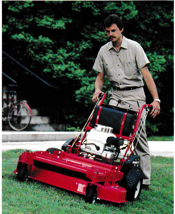
Pro with 40" (102 cm) Mower, wide-spaced wheels provide hillside stability.