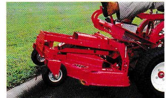
Pro Master rides easily over curbs.