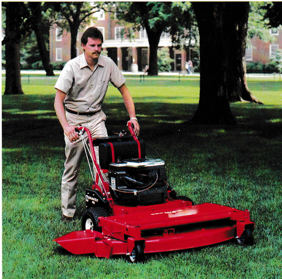
Pro with 50" (127 cm) Mower.