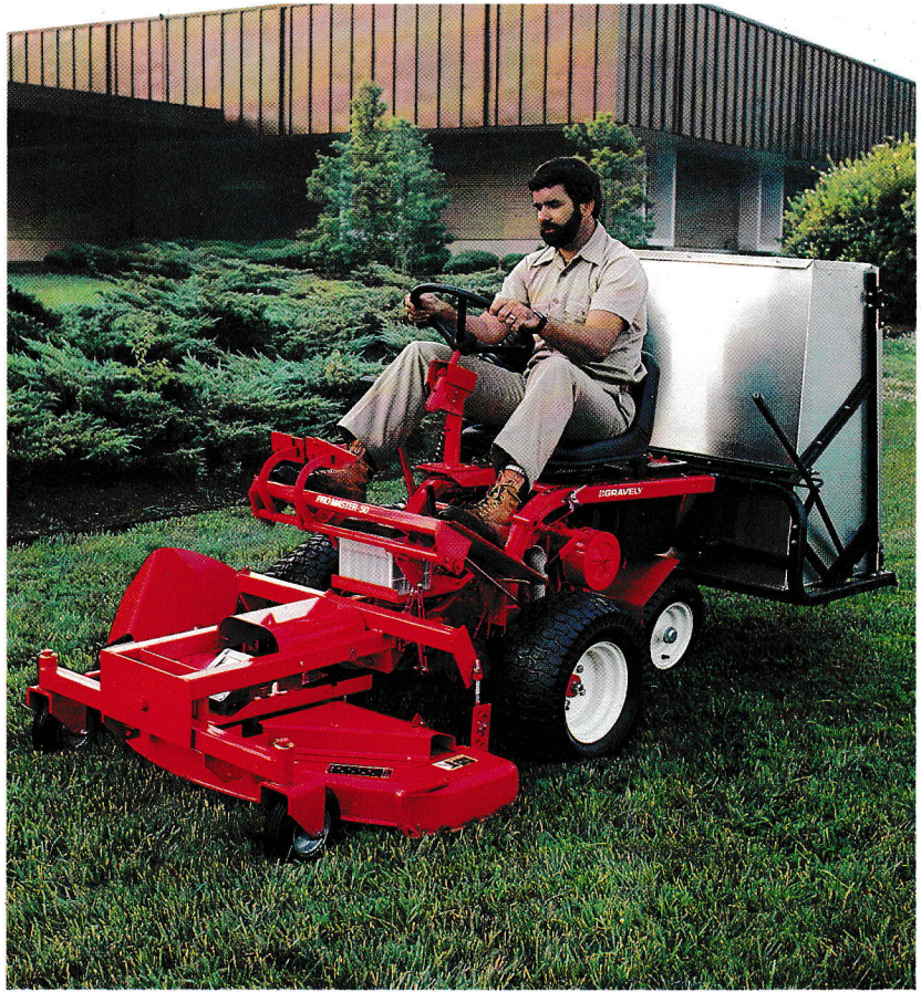
Optional grass catcher dumps from seat.