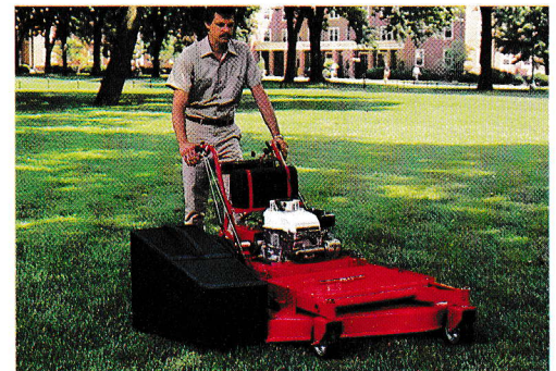
Pro with 40" (102 cm) Mower and optional wire basket grass catcher.