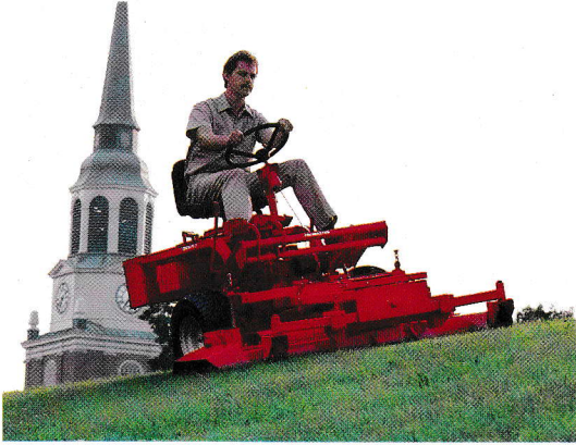
Unique hinged frame provides added traction on hills.